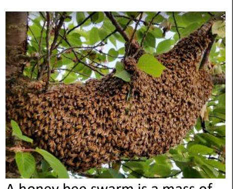
A honey bee swarm is a mass of bees hanging from a limb, branch, or other object.